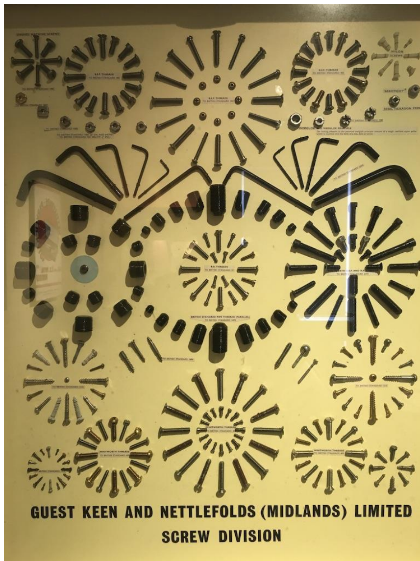
Fig 1, Advertising board that used to hang in the GKN factory in Smethwick