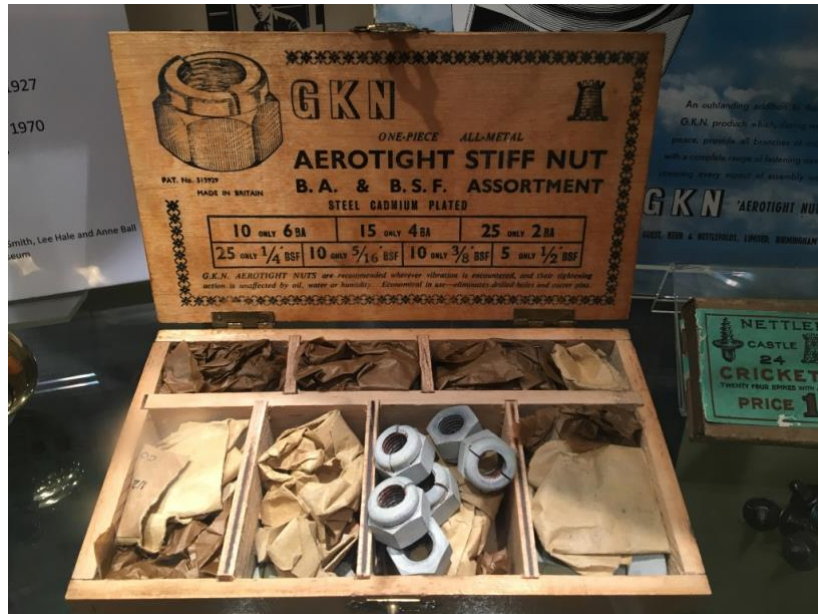
Fig 2, Can anyone own up to having any Aerotight Stiff Nuts at home somewhere?