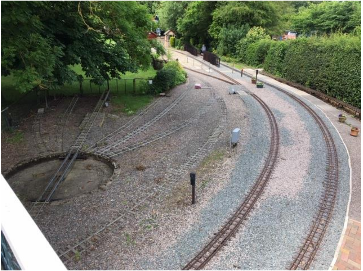
Near this is a 16mm raised layout